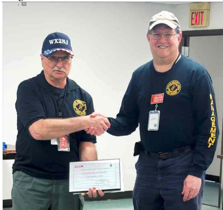
WX2NJ and KD2FFR